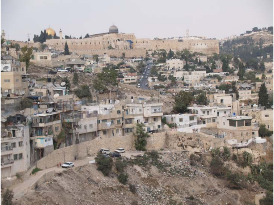
FIGURE 4 Wadi Hilweh today, looking north toward the Haram esh-Sharif/Temple Mount.

in Silwan: while millions are poured into the recovery and preservation of ancient remains, the tax-paying Palestinian residents are entirely elided from the ‘renovation’ process, their dilapidated infrastructure standing in marked counterpoint to both the remarkable engineering feats required to expose the antiquities and to the grandeur of the ancient remains themselves. Rather than existing as some sort of unsullied, noble element, archaeology has been implicated in the conflict of communities and identities in what is still a divided city. What is required, therefore, is an overall archaeological policy that transcends conflict and allows archaeology to serve the needs of all the inhabitants of Jerusalem, under any future configuration.