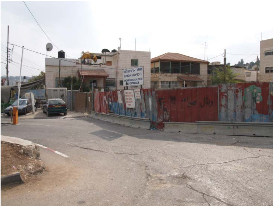
FIGURE 5 Excavations in Silwan/City of David, 2006.